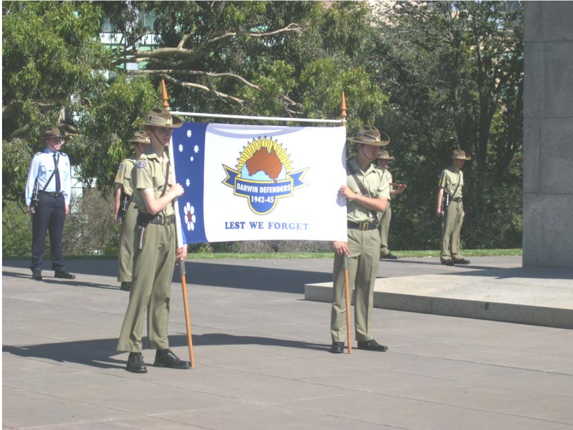
2 Darwin Defenders 2010

From: DVA e-News To: e-news@dvalists.aaa.net.au Sent: Wednesday, March 17, 2010 5:41 PM Subject: DVA e-News - Issue 1, 2010 [SEC=UNCLASSIFIED]