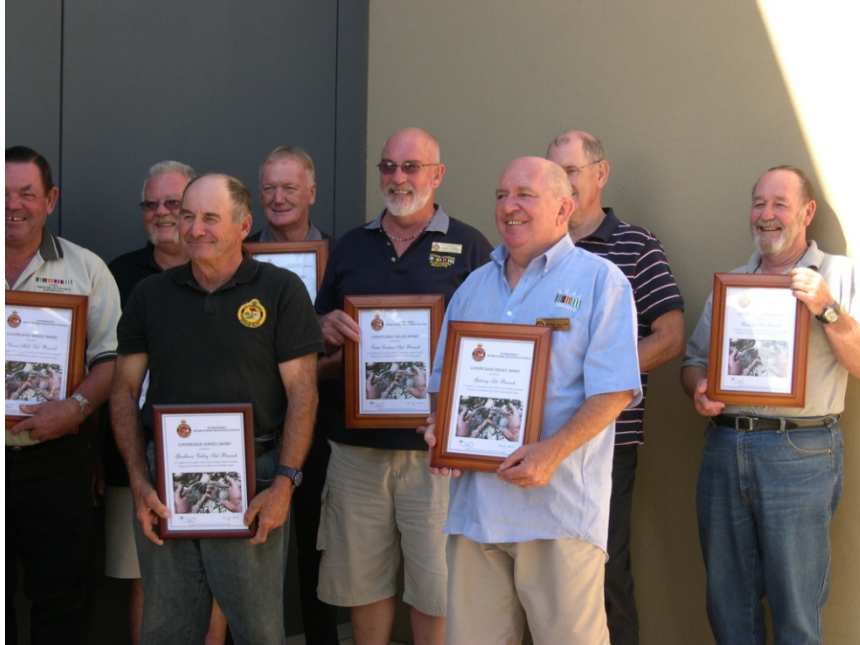
Certificates of appreciation for those Sub-branches that assisted in one way or another after the Black Saturday Bushfires. Presented at the State Conference at Bendigo.

Acknowledge the value of TPI Veterans undertaking voluntary work, and ensure that voluntary work is not considered in relation to any compensation or pension payments.